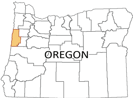
Study Location Map

The flood hazard data show areas expected to be inundated during a 100-year flood event. Flooding sources include riverine. Areas are consistent with the regulatory flood zones depicted in Lincoln County's Digital Flood Insurance Rate Maps.