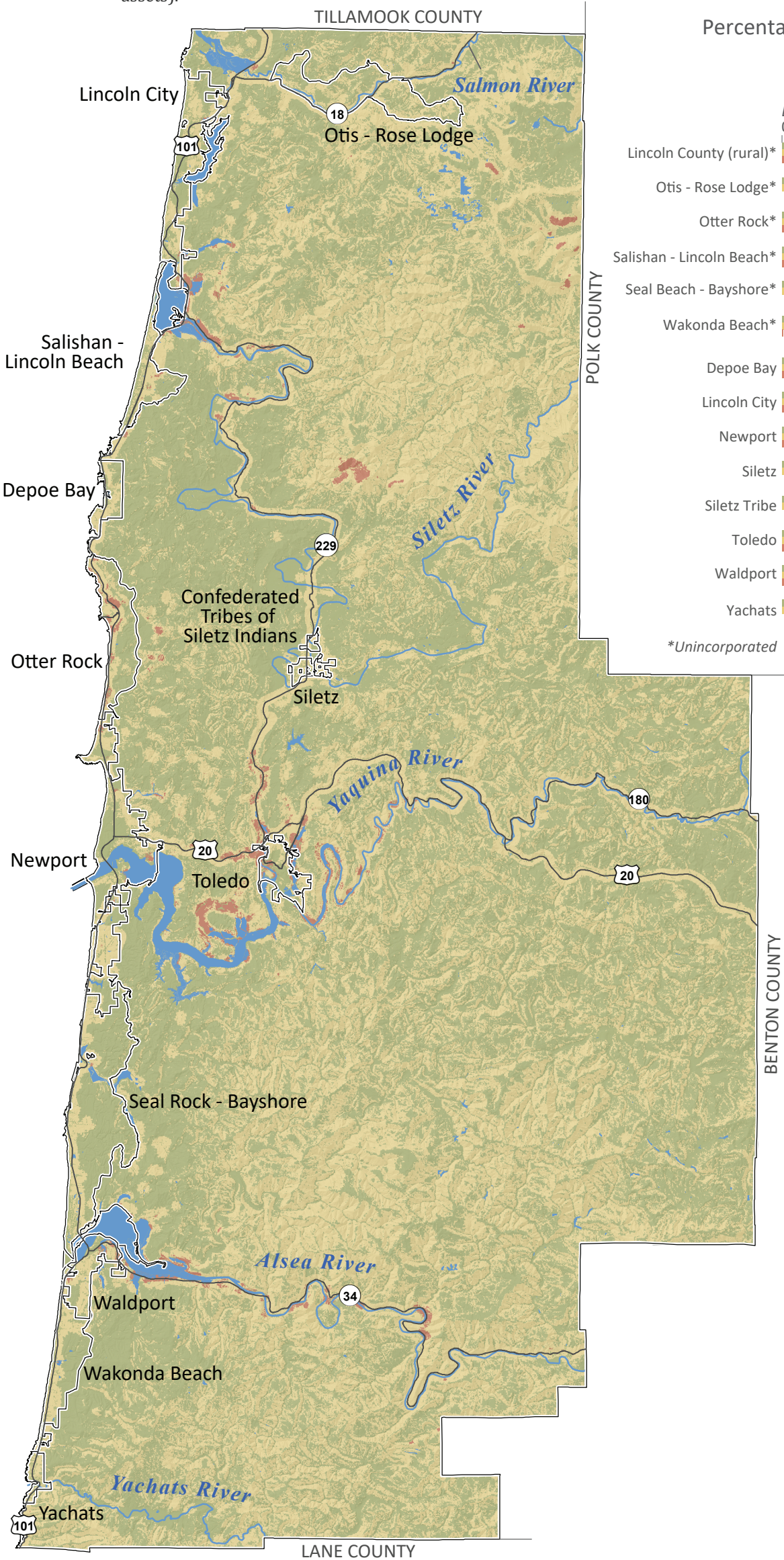
Percentage of Building Value Exposed to Wildfire