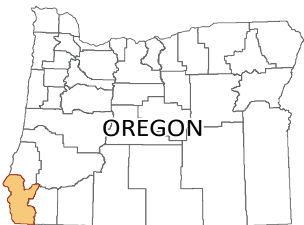
Study Location Map

The flood hazard data show areas expected to be inundated during a 100-year flood event. Flooding sources include riverine. Areas are consistent with the regulatory flood zones depicted in Curry County’s Digital Flood Insurance Rate Maps.