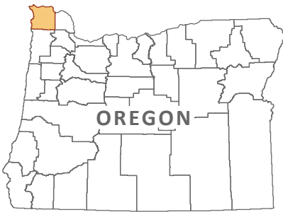
Study Location Map

This map is an overview map and not intended to provide details at the community scale. The GIS data that is published with the Clatsop County Natural Hazard Risk Assessment can be used to inform regarding queries at the community scale.