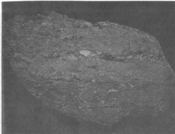
Figure 1. Conglomerate boulder illustrates typical fragment size range. Pencil gives scale. Note graded bedding and tendency of pebbles to lie flat in plane of bedding.