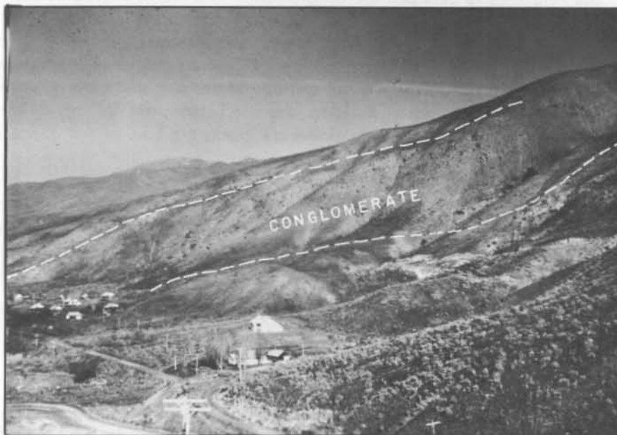
Figure 4. View northeast from point near cement plant at Lime. Conglomerate in middle ground unconformably overlies Upper Triassic limestone and associated sediments and is overlain by Jurassic sandstones and shales.