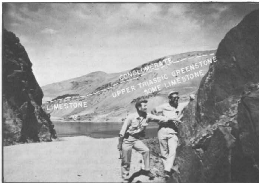
Figure 3. View northeast across Snake River from point near Bay Horse mine. Conglomerate caps ridge in middle distance and overlies Upper Triassic greenstone and limestone. Gypsum has been mined from cuts labeled (G) just above river's edge. Rocks in road cut in foreground are also Upper Triassic greenstones.