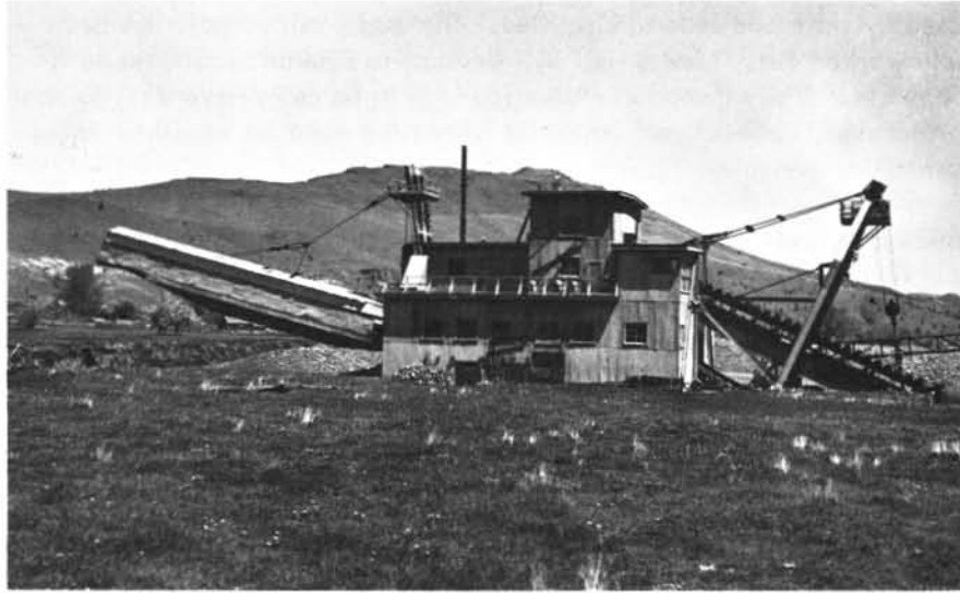
This bucket line gold dredge mined gravels along the John Day River between the towns of John Day and Mount Vernon from 1937 to 1942.