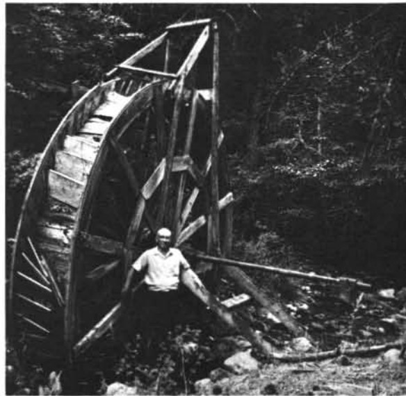
Old wooden water wheel on Salmon Creek in Baker County was used to power the Dixon gold arrastra in the early days of gold mining.