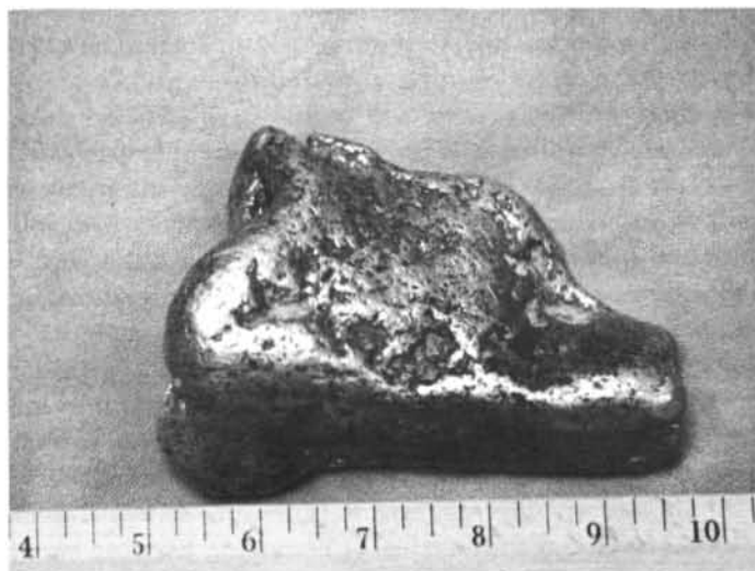
The Armstrong nugget, found in 1913 in a placer mine near Susanville, Grant County, Oregon, weighs 80.4 ounces. As a nugget it is worth many times the value of the metal. Scale is in inches.