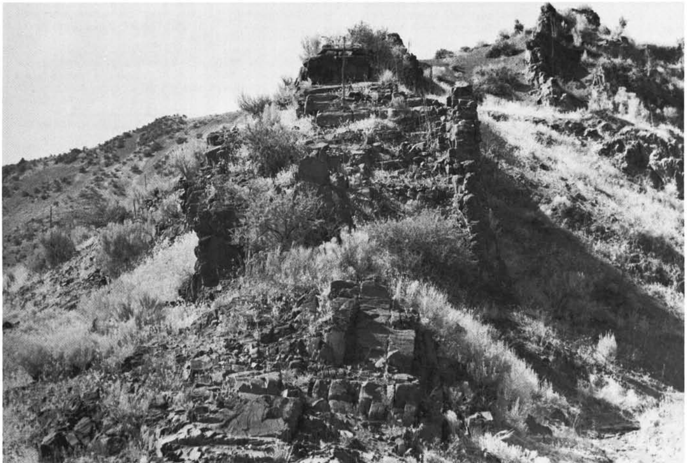
Figure 3. Mafic dike in positive relief. Country rock is easily eroded mudstone of the Hudspeth Formation, 2.8 mi west of Mitchell.

The zone of transition between the fine-grained margins and the coarse-grained interior of dikes is only 7-10 in. wide (Figure 6). Within this zone, elongate crystals of clinopyroxene and plagioclase are suspended in a fine groundmass and become larger and more abundant toward the interior. Near the inner boundary of the transition zone, the groundmass is represented by small, fine-grained patches of late-crystallizing