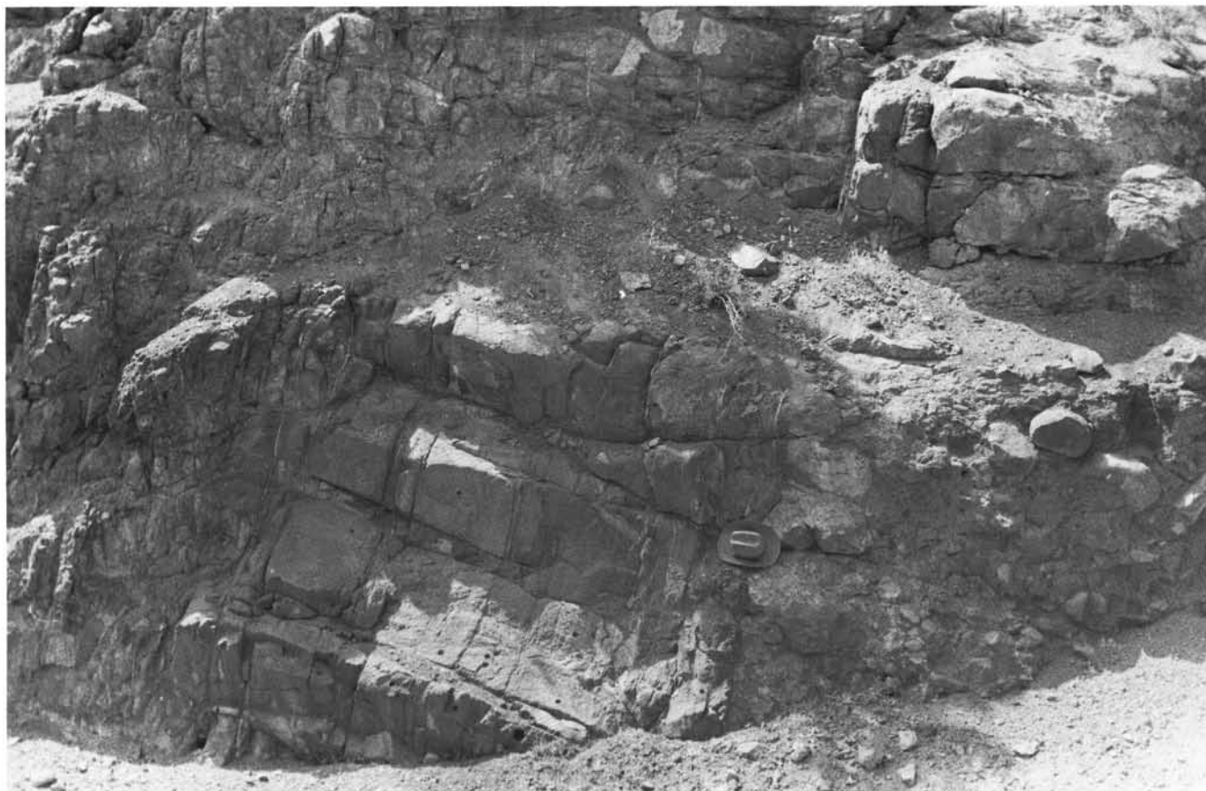
Figure 4. Columnar jointing in the Keyes Creek dike adjacent to U.S. Highway 26. Hat rests upon contact with volcanic mudflow deposits of the Clarno Formation.

feldspar, largely altered to smectite (Figure 5B).