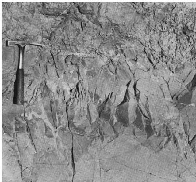
Figure 6. Transition zone from fine-grained, close-fractured margin (below head of hammer) to coarse-grained interior of mafic dike (above head of hammer).

with basaltic lavas in the lower part of the John Day Formation northwest of Mitchell (Figure 1). The John Day lavas lack phenocrysts and contain high Fe and Ti (Table 1, column 5). It is not suggested that the mafic dike system was the direct source of these particular John Day lavas, because the dikes are high-Si, low-K tholeiites while the lavas are low in Si and high in K, transitional to alkali basalts (Robinson, 1969).