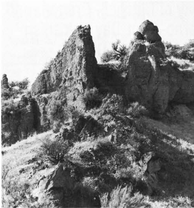
Figure 2. Mafic dike in negative relief. Country rock is erosionally resistant conglomerate of the Gable Creek Formation, 3.8 mi west of Mitchell.

Clarno Formation have been so indurated in close proximity to the dikes that double walls of erosionally resistant mudflow can be found standing in relief along dike margins.