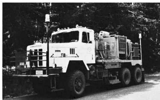
CXC Company of Houston developing seismic data by vibroseis method in Columbia County during June 1982. Truck generates energy that vibrates the earth for reflection seismology.